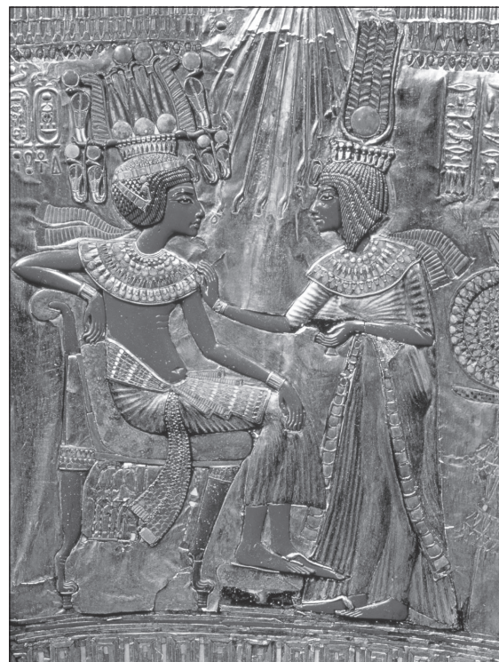
The back of the throne of Tutankhamen depicting an Egyptian pharaoh and his wife. She is helping him get dressed.

Now that you’ve studied marriage and family life in ancient times, aren’t you glad you were born a few thousand years later?