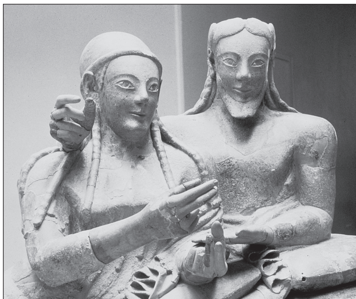
Sculpture of an Etruscan couple from the sixth century BCE. The Etruscans were the rulers of early Rome.

Once married, Roman wives were not confined to the home as were their Greek counterparts. They could go about freely, and many held jobs. They could even join their husbands in entertaining guests. But they lacked political rights; they could neither vote nor hold public office. Politics was a domain reserved exclusively for their husbands.