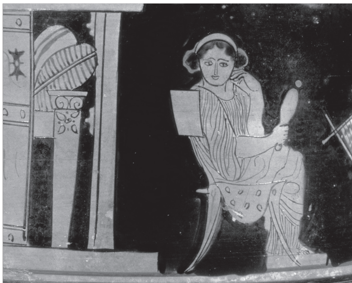
A young Greek bride readies herself for her wedding; from a fifth-century BCE vase painting.

But this is only the beginning! In ancient Greece, romantic love was looked upon as a form of madness. The purpose of marriage was to have