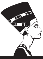
Table of Contents continued