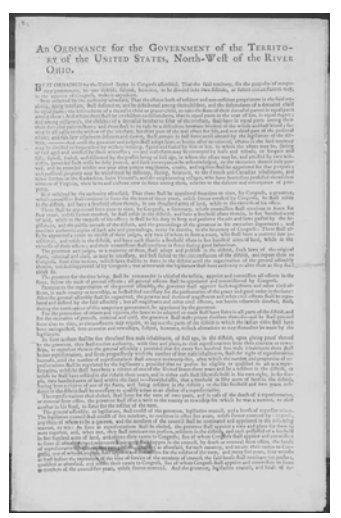
The Northwest Ordinance