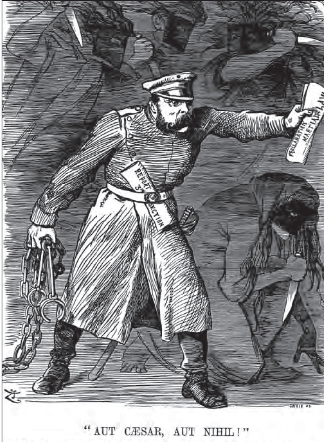
Cartoon from Punch