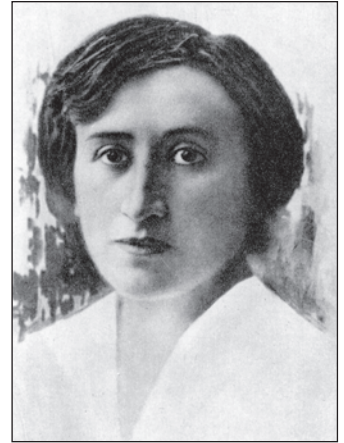
Poster Collection, Hoover Institution Archives