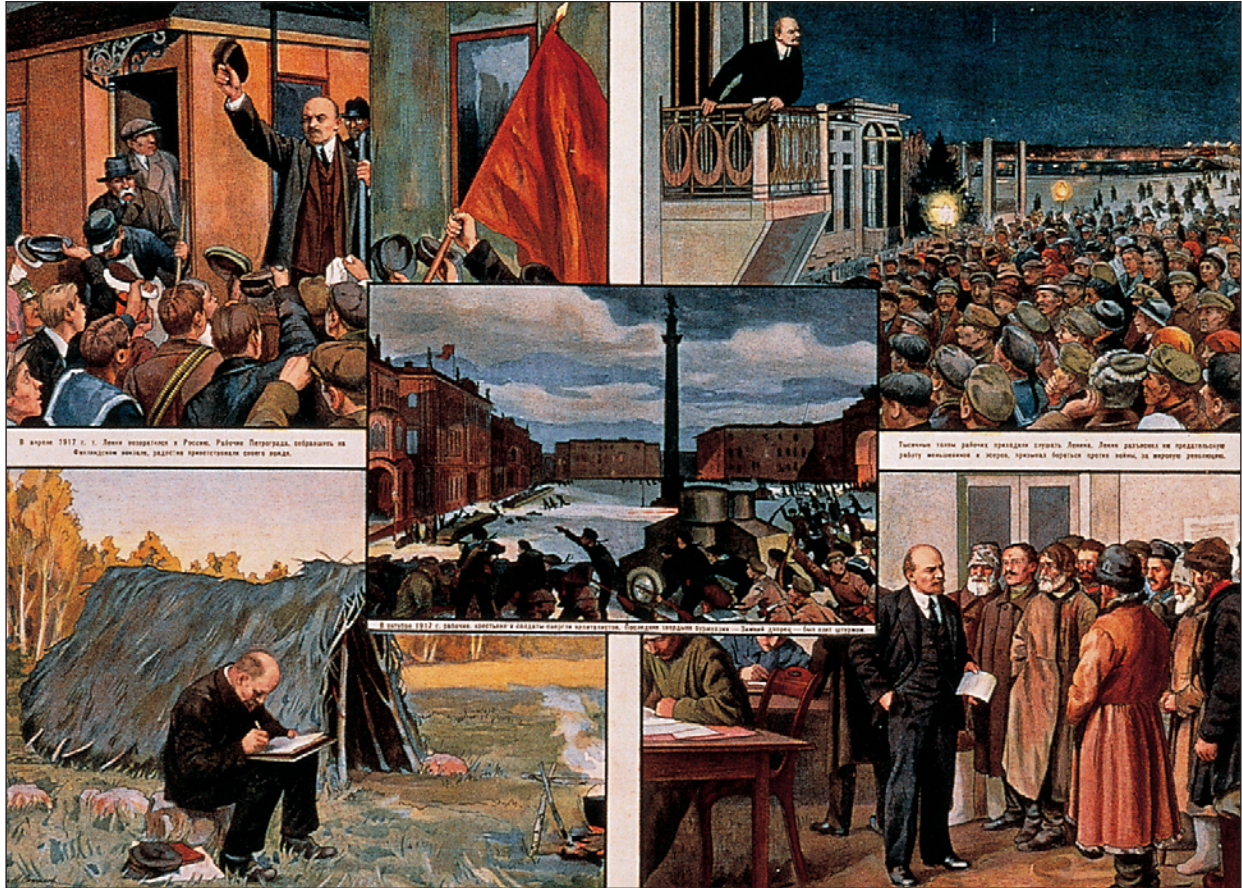
Poster Collection, Hoover Institution Archives