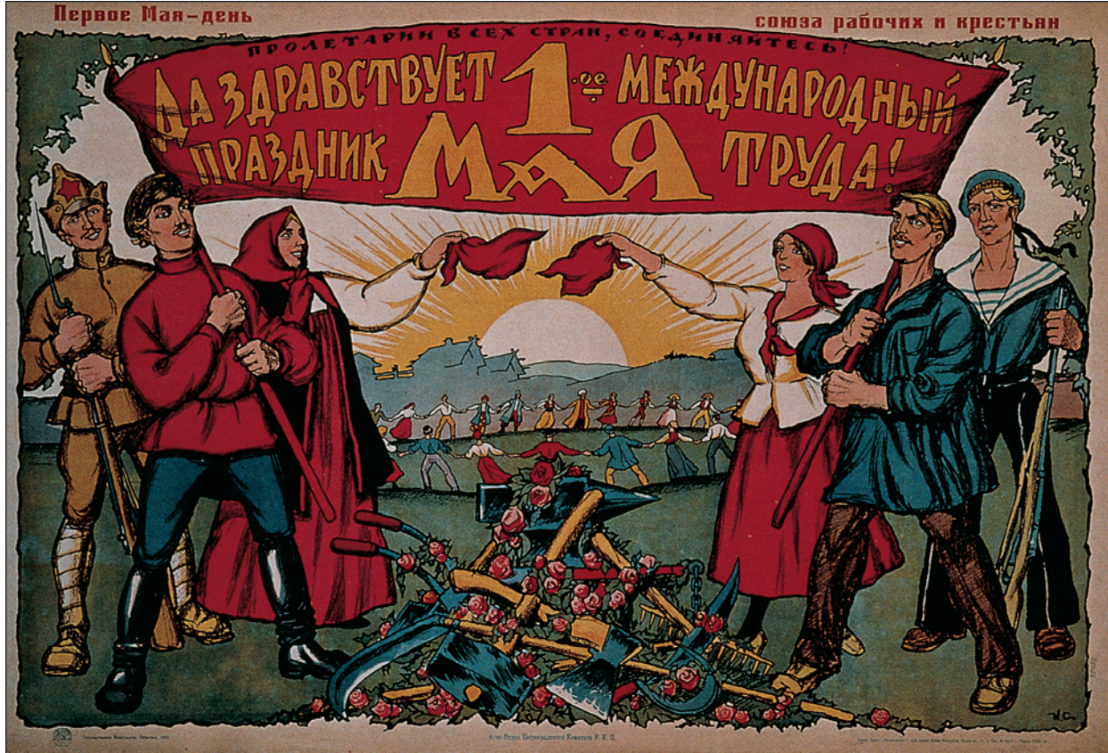
Poster Collection, Hoover Institution Archives