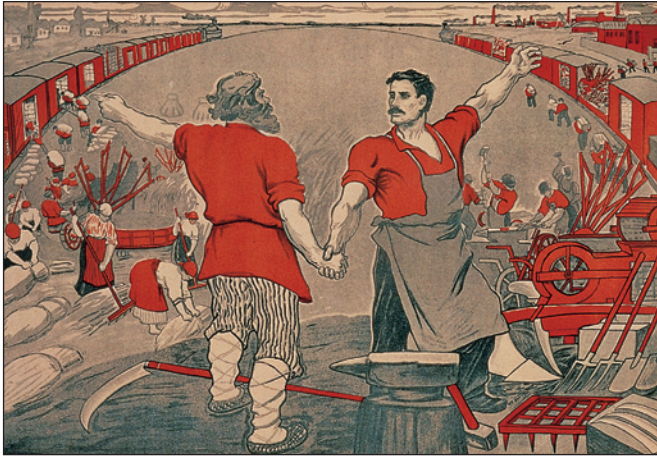
Poster Collection, Hoover Institution Archives