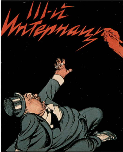
Poster Collection, Hoover Institution Archives