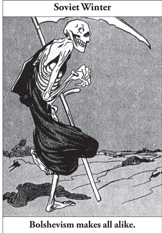
Stock Montage, Inc.